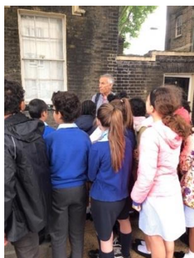
St Anne's Primary School

The Huguenots of Spitalfields Charity ceased operations at the end of 2021 and we were overwhelmed with the responses we received.