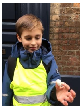
'What on earth is this?' (A cocoon)