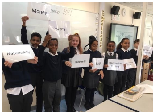
Pupils thinking about the issues that face refugees, from St Anne's Primary School, Spitalfields